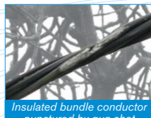
Insulated bundle conductor punctured by gun shot allowing moisture to corrode aluminium within